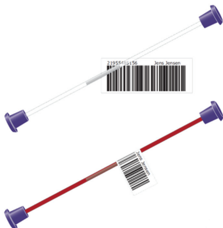
FIGURE 2. Recommended capillary blood gas sample labelling (source: Wennecke G, Dal Knudby M. Avoiding preanalytical errors – in capillary blood testing. Radiometer Medical Aps, Brønshøj, Denmark, 2009.)

Laboratory personnel are responsible for appropriate written instructions for sample collection according to the ISO 15189 standard (27). Arterial blood collection is performed by physicians (18) and nursing graduates (19) in healthcare institutions in Croatia. In order to ensure arterial sample quality and result reliability, laboratory personnel should inform ward personnel responsible for arterial blood collection of the required procedures.